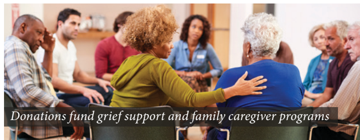
Donations fund grief support and family caregiver programs

Thank you for considering making a year-end gift to Hope Hospice. You can give online at HopeHospice.com/donate , or mail a check to 6377 Clark Avenue, Suite 100, Dublin CA 94568. Questions? Call (925) 829-8770. ➤